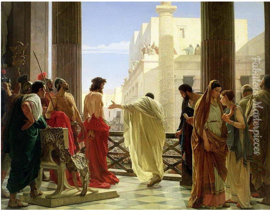
Antoni Ciseri 'Ecce Homo' – Behold the Man!

Created between (1821 – 1891) by Antonio Ciseri who was a significant 19th century Italian artist who rejuvenated religious painting.